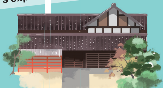
11 旧西尾家住宅 Nishio-ke jutaku

Local volunteers explain this cultural heritage to you.