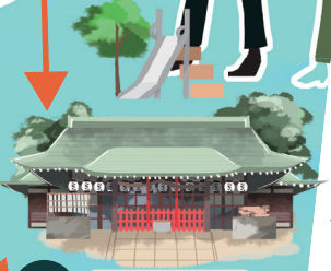
9 高浜神社 Takahama shrine