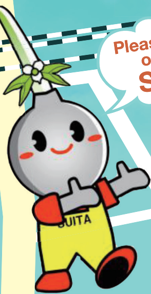
SUITA City Mascot 「すいたん」 SUI-TAN